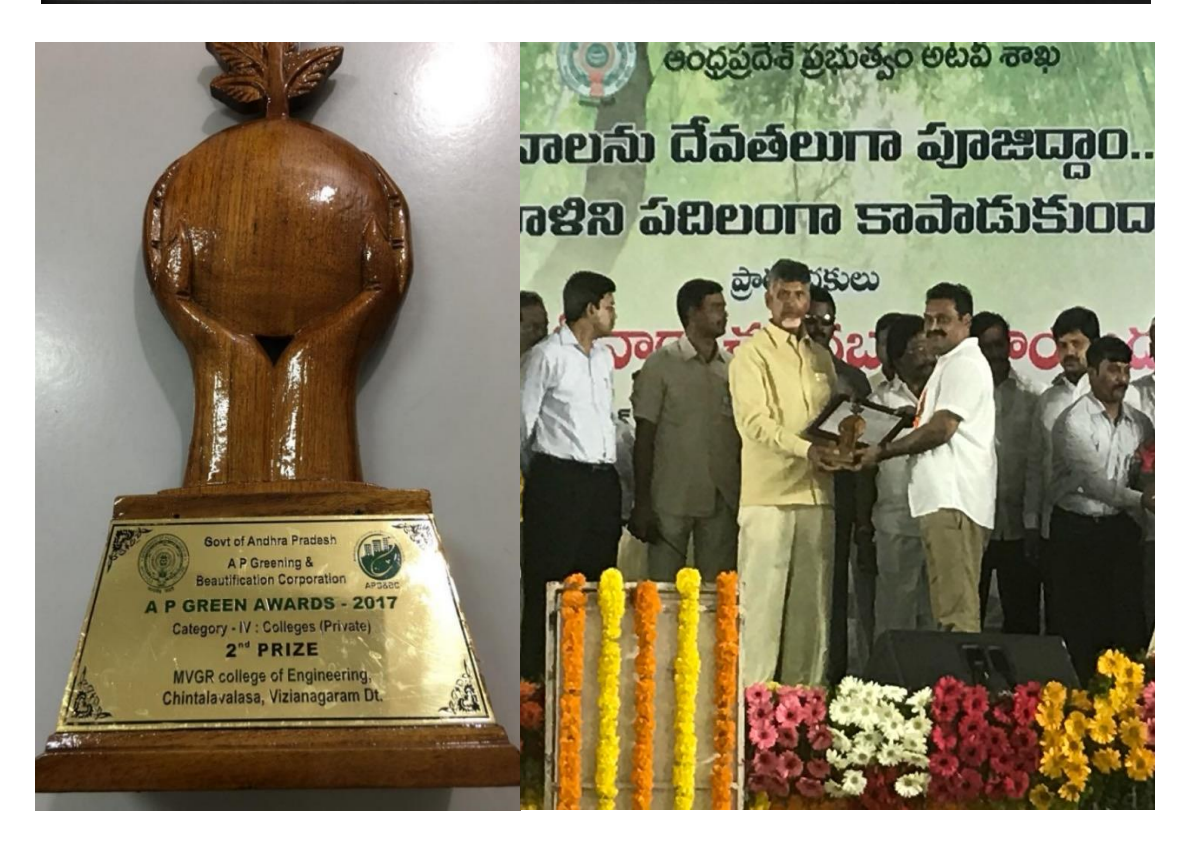
Award and Trophy received our respected Principal from Honorable Chiefe Minister of Andhra Pradesh